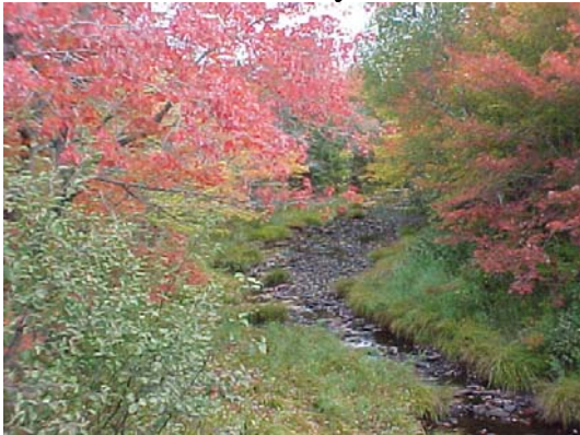
of False Bay on a nice Oct. day.