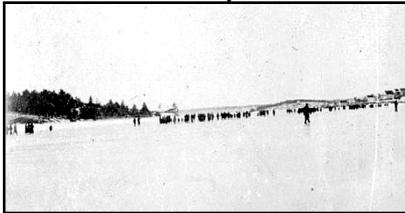
People returning from church on a winter's day long ago.