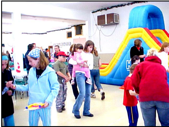
An indoor playground.