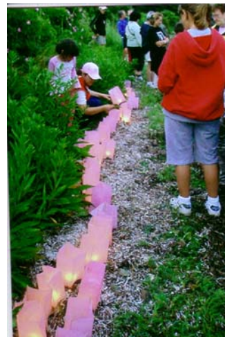
Lanterns being lined up along the shore.