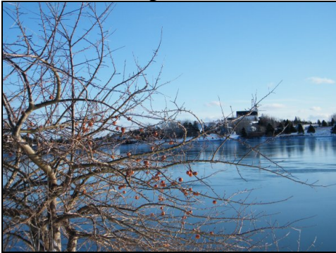
Photo taken by Deborah Fougere of RB showing apples still on the trees on the 31 st of January.