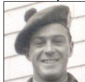
Roman Way Convalescent Hospital, Holland March 25 th , 1945