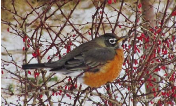
Robin seen in Grand Gully